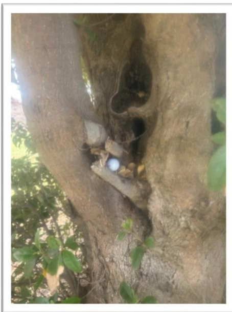
9th Hole – Took a lot of skill to land a ball in that position. Well, done Tom

It's a rare but amusing sight when a golf ball decides to take up residence in a tree instead of returning to the fairway. Those little spheres can sometimes get lodged in the branches or foliage, hanging out high above the ground as if they've found a new home. It's one of those quirky moments in golf that adds a bit of unexpected humor to the game. So, what do you do in this situation?